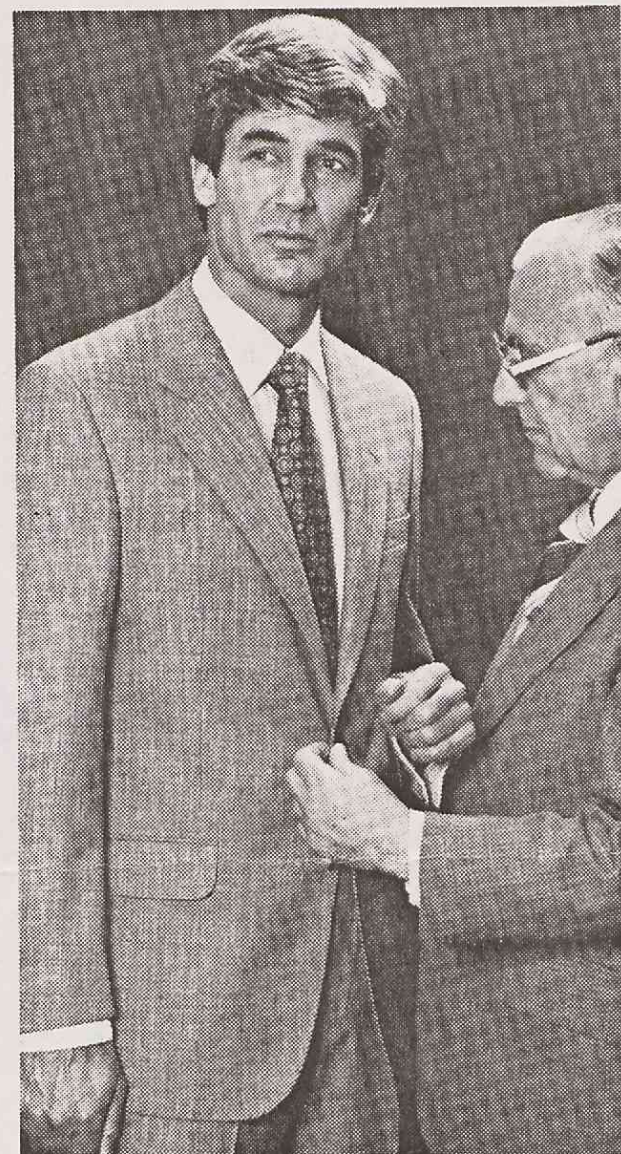
A final check for a great fit.

In the trousers is the famous secret pocket - we'll tell you where it is when you come in.