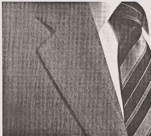
Mid-weight woolblend two piece suit $236.